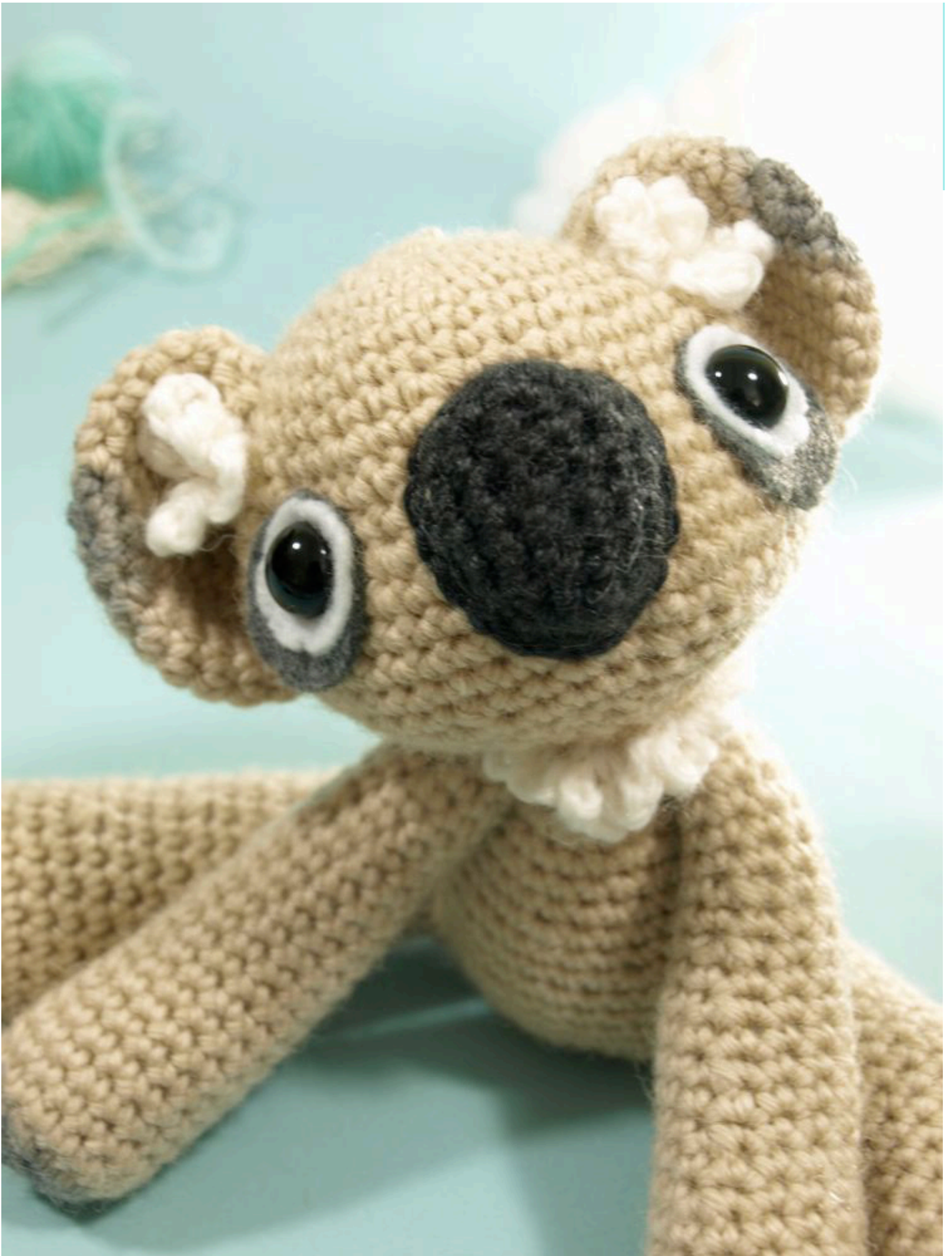
Copyright © 2009 Dawn Toussaint. All rights reserved.